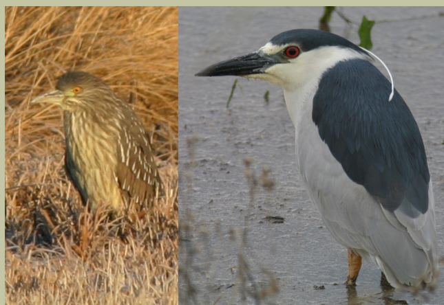
Black-crowned Night Heron