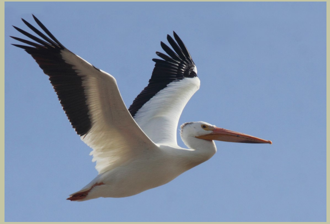
American White Pelican