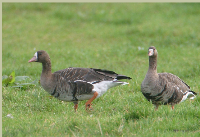
Greater White-fronted Goose